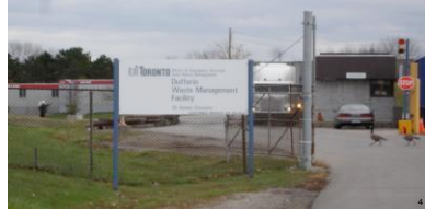
WASTE TRANSFER STATIONS-TORONTO, CANADA