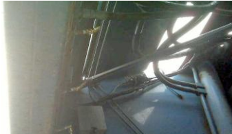
Automatic Spray Misting System Inside The Back of Truck