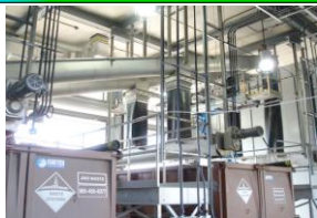
Mississauga WWTP, Canada-Odor Control For the Grit Screening Screw Conveyor Operation