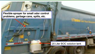
BOC AUTOMATIC ODOR CONTROL SYSTEM FOR GARBAGE TRUCKS IN-TORONTO, CANADA