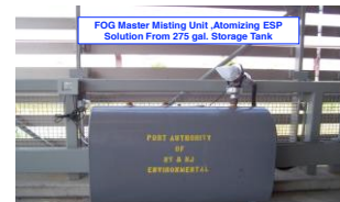
BOC ODOR CONTROL FOR 7 MILE DRAINAGE CANAL- PORT AUTHORITY OF NEW YORK/NJ