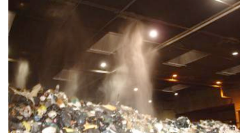
BOC ODOR CONTROL USING MISTING SYSTEM