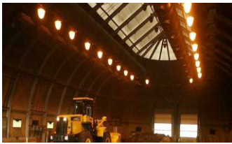
ODOR CONTROL IN NEW YORK CITY- RESIDUAL WASTE FACILITY- (COMBINATION OF GRIT SCREENING AND FOG'S )